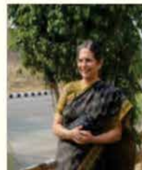
Justice Bela Trivedi