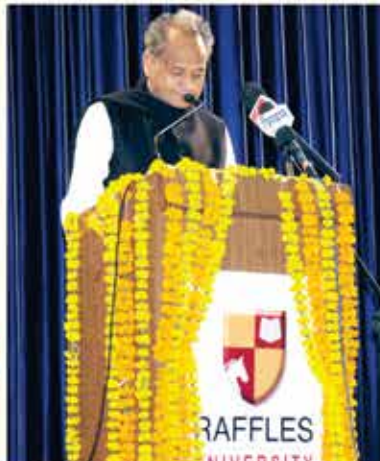
Mr. Ashok Gehlot