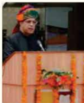
Justice A.K. Sikri