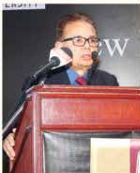
Justice Dalveer Bhandari